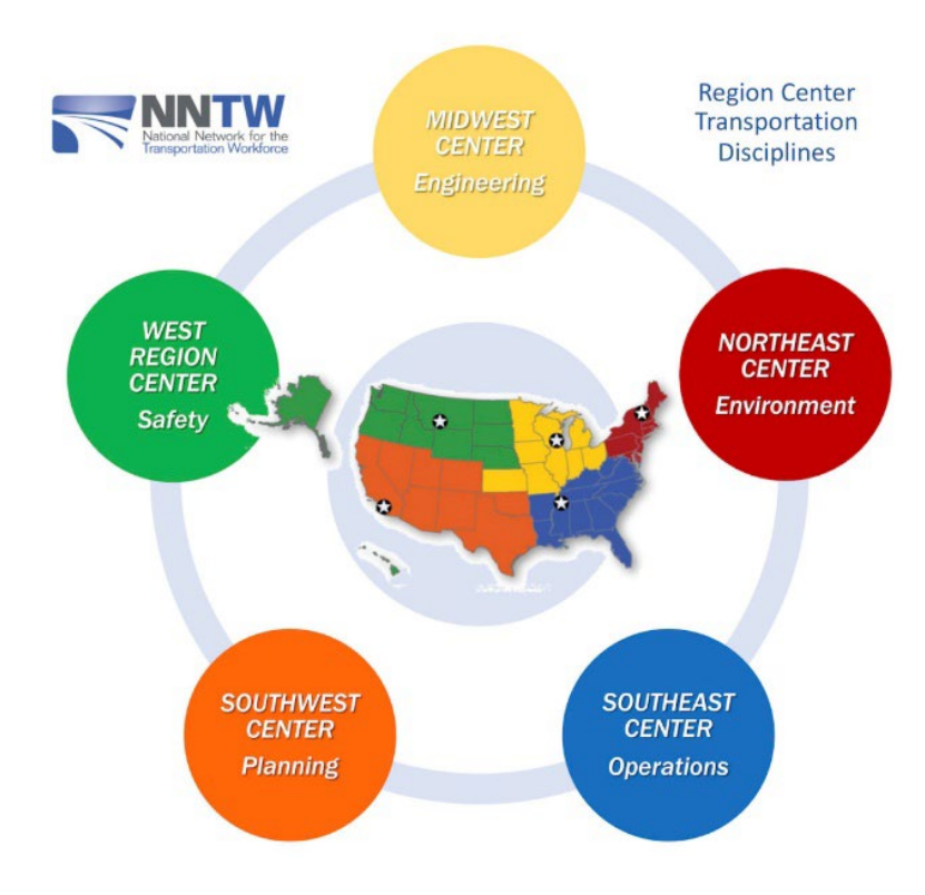
Figure A-1: National Network for the Transportation Workforce Regional Centers